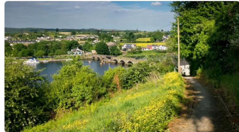
Discover the scenic walks in Ireland's Hidden Heartlands.

FREE THINGS TO DO WALKING AND HIKING NATURE AND WILDLIFE THE GREAT OUTDOORS